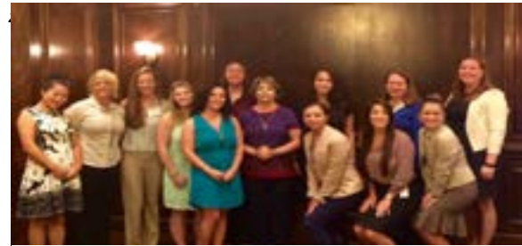
September 2016 – Attendees at the Dallas Chapter Women in ASHRAE Networking Event